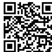
Giving QR code