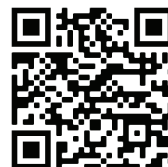
Giving QR code