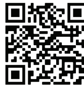
Giving QR code